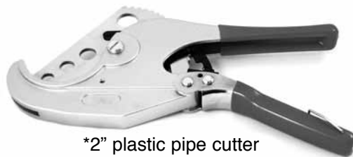
*2" plastic pipe cutter