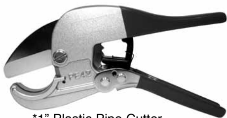
*1" Plastic Pipe Cutter