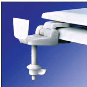
Corrosion proof, self-aligning hardware

Comfort ™ Seats molded wood utilizes the finest paint to seal and beautify the molded wood core with deep lustrous color and rock hard enamel durability.