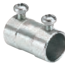
1/2" thru 2"