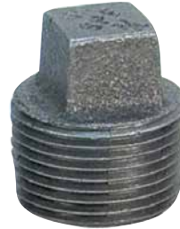
Fig. 3110 (Solid Square) or Fig. 3111 (Cored Square)