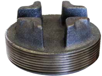
Fig. 3112 (Cored Bar)